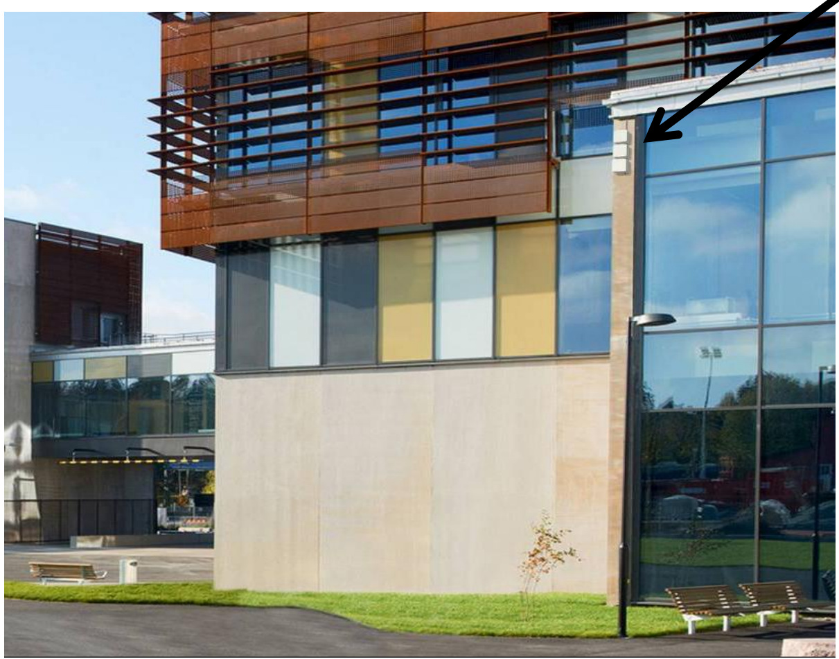
Examples of Ericsson small cells

6.20 The Committee felt strongly that the potential for a substantial revenue and capital income stream to the Council was very important and the momentum on investigations needed to be maintained to ensure this potential was realised. This was a substantial capital and revenue income stream discovered and developed through this review and a company had now been identified as a potential partner to achieve this income.